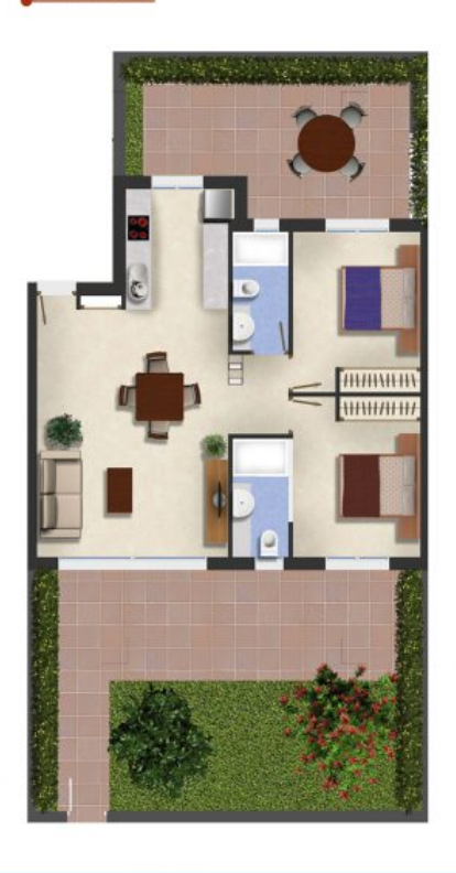
Imagen Artística carece de valor contractual/Artistic Image free of contractual nature