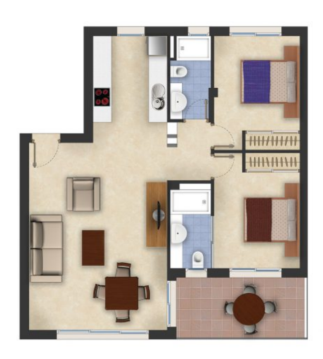
Imagen Artística carece de valor contractual/Artistic Image free of contractual nature