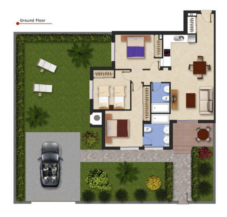
Imagen Artística carece de valor contractual/Artistic Image free of contractual nature

Model: Alba Garden Property: 96,3m<sup>2</sup> Garden: 125-180m<sup>2</sup> 3 Bedrooms 2 Bathrooms