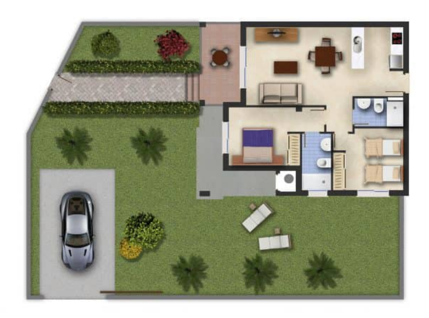
Imagen Artística carece de valor contractual/Artístic Image free of contractual nature

Model: Alba Garden Property: 76,7m<sup>2</sup> Garden: 65-146m<sup>2</sup> 2 Bedrooms 2 Bathrooms