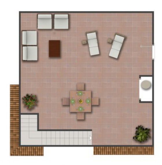
Imagen Artística carece de valor contractual/Artistic Image free of contractual nature