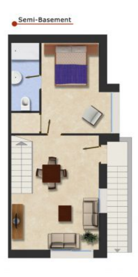
Imagen Artística carece de valor contractual/Artístic Image free of contractual nature