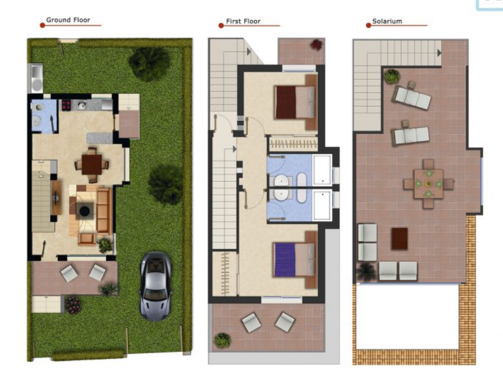
Imagen Artística carece de valor contractual/Artistic Image free of contractual nature

Model: Samara Corner Property: 100,6m<sup>2</sup> Garden: 90m<sup>2</sup> Roof-Terrace: 30m<sup>2</sup> 2 Bedrooms 3 Bathrooms