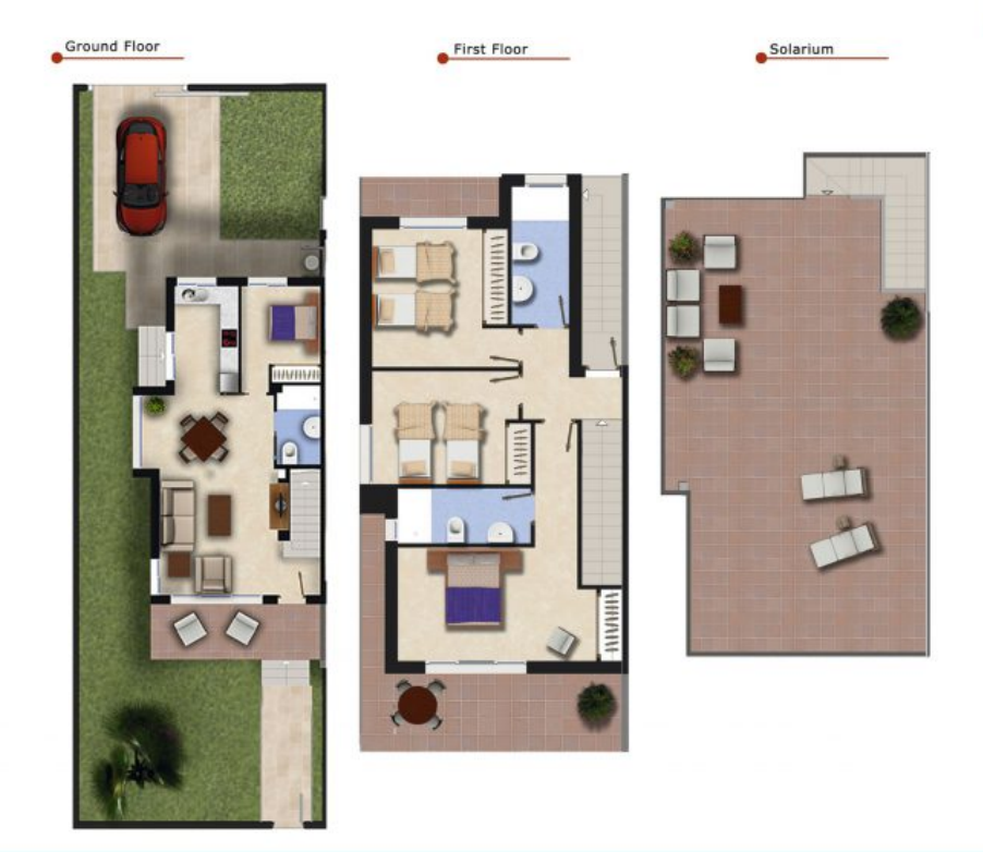
Imagen Artística carece de valor contractual/Artistic Image free of contractual nature

Model: Ivory 4 Dorm Property: 137,19m<sup>2</sup> Garden: 100m<sup>2</sup> Solarium: 55m<sup>2</sup> 4 Bedrooms 3 Bathrooms