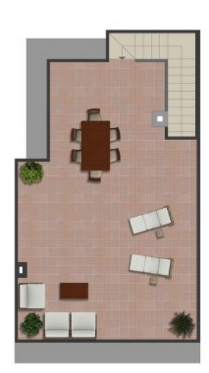
Imagen Artística carece de valor contractual/Artistic Image free of contractual nature