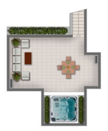
Imagen Artística carece de valor contractual/Artistic Image free of contractual nature