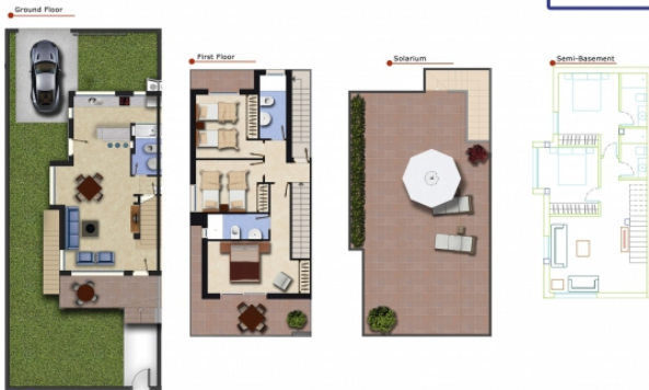
Imagen Artística cance de valor contractual/Artistic Image Free of contractual nature

Model: Ivory Corner Property: 203,9m 2 Garden: 115m 2 Roof-Terrace: 50m 2 Semi-Basement: 71,7m 2 5 Bedrooms 5 Bathrooms